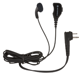
Earbud with In-line Microphone and PTT