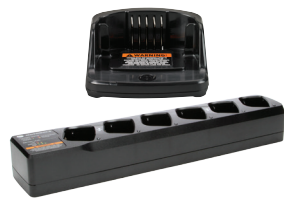
Single and Multi-Unit Chargers