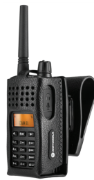
Leather Carry Case