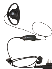
D-Style Earpiece with In-line Microphone and PTT

XT600d Series radios are compatible with XT400 Series accessories except the carry holster and leather case.