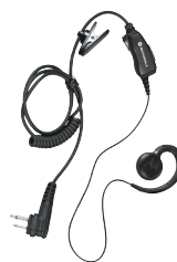
Swivel Earpiece with In-line Microphone and PTT