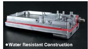
•Water Resistant Construction

Built to meet or exceed the requirements of the U.S. MIL-STD 810 C/D/E standards, the VX-160 is designed to survive under difficult operating conditions of shock, vibration, and driving rain. Cost-performance begins with durability, and the Mil-Spec toughness of the VX-160 is your guarantee of its design quality.