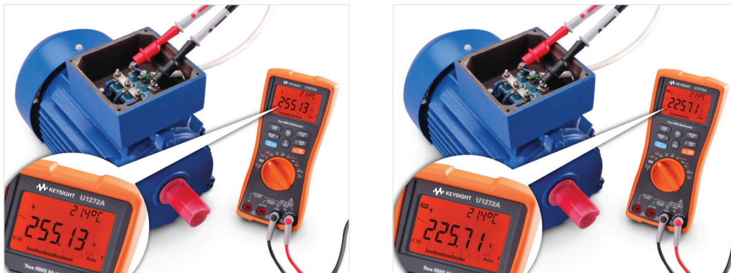
Figure 1. Comparison of voltage output from industrial motor VFD without and with Low Pass Filter functionality.

The U1270 Series offers a 1 kHz LPF or Low Pass Filter to provide accurate Variable Frequency Drive (VFD) output measurements. This function eliminates high frequency noise and harmonics, ensuring motor filter efficiency.