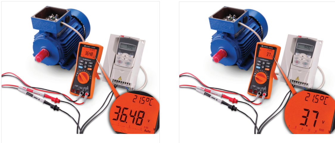
Figure 2. U1272A helps you identify the presence of stray voltage on a disconnected wire running parallel with the wire powering up the VFD to an industrial motor. The image on the right shows the U1272A in low impedance mode.

The peak detect function allows you to capture the engine or motor startup transient as fast as 250 \mu s.