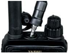
Waterproof Connectors and Microphone Jack