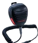
Submersible Mic Plug