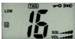
Actual display size.

The IC-M34 has an easy to see LCD (32x16 mm; 1¼x5⁄8 in) with large 2-digit channel number indication. The volume and SQL levels are shown in the display. LCD and key backlighting is standard for night time operation.