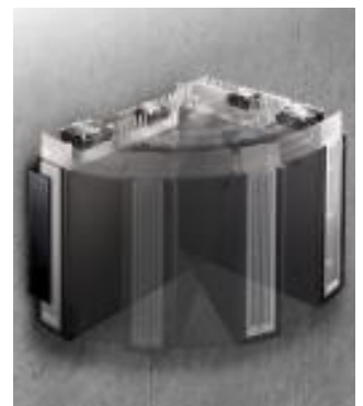
Installation on a wall with the MB-77