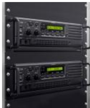
19-inch rack mount, MB-78