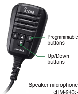
Speaker microphone <HM-243>

Enjoy portable operations with the supplied HM-243, programmable speaker microphone. Perfect for operation with the IC-705 safely secured in the optional LC-192 backpack. User assignable buttons put functions like frequency and volume adjustments at the tip of your fingers, without removing your backpack.