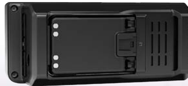
BP-272 attached (Rear panel view)

Utilizing the high capacity Li-ion battery from the ID-51E and ID-31E handheld radios. A 13.8 V DC external power supply can be used for operation and charging of the BP-272.