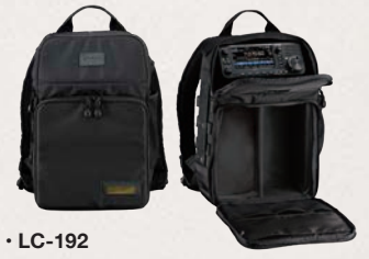
• LC-192 Multi-function backpack

Visit our website for more details on the LC-192