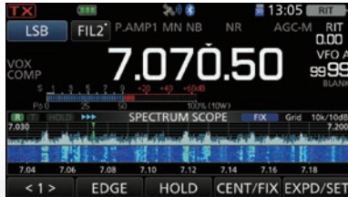
Display example of real-time spectrum scope and waterfall

Performance seen with the IC-7300 and IC-9700 spectrum scope is at the tip of your fingers for field operation. You can quickly see band activity as well as finding a clear frequency, all in the compact radio and not as an expensive add-on.