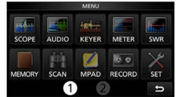
Menu screen example