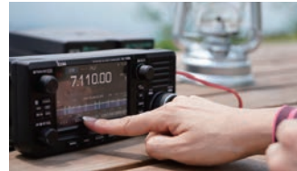
Touch screen display

The large 4.3" colour TFT touch LCD, same size as the IC-7300 and IC-9700, offers intuitive operation of functions, settings, and various operational visual aids, such as the band scope, waterfall, and audio scope functions.