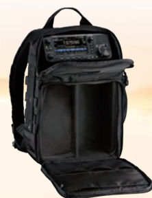
LC-192 Multi-function backpack

Optional Backpack, LC-192, Ideal for Field Operations