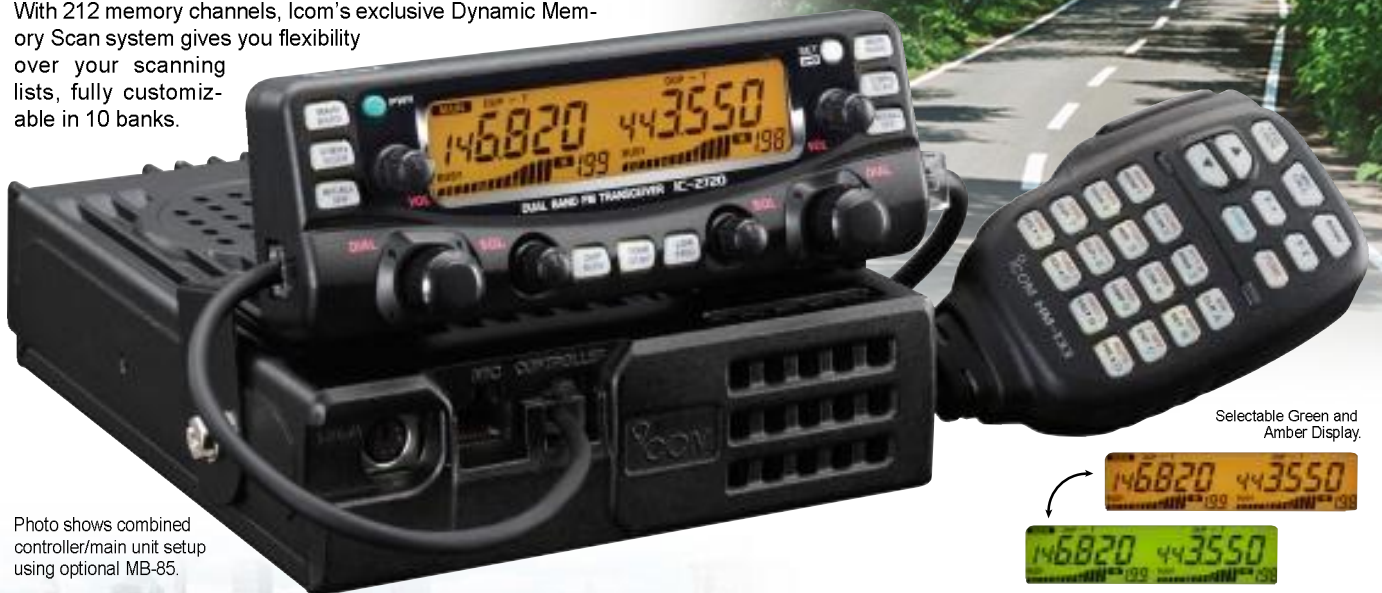
Photo shows combined controller/main unit setup using optional MB-85.

With 212 memory channels, Icom's exclusive Dynamic Memory Scan system gives you flexibility over your scanning lists, fully customizable in 10 banks.