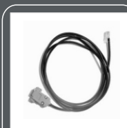
PC15 Receiver programming cable