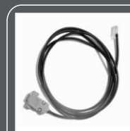
PC14 Transmitter programming cable