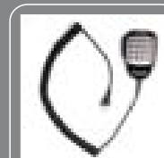
Keypad microphone SM07R1