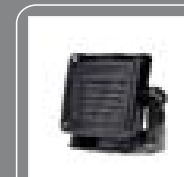
External speaker SM09S2