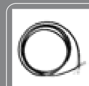
Cloning cable CP06