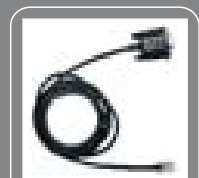
Programming cable PC21