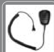
Palm microphone SM07R2