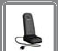
Desktop Microphone SM10R2