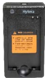
Rapid-Rate Charger (for Li-Ion Battery) CH10L20