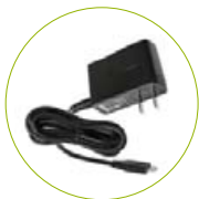
Micro USB Power Adapter (5V/1A)