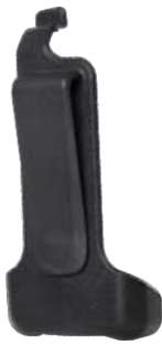
PD36X Belt Clip