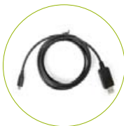
Programming Cable PC69