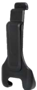
PD35X Belt Clip