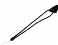
Hand Strap Stylus