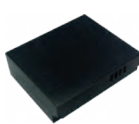
Extended Battery (2060 mAh)